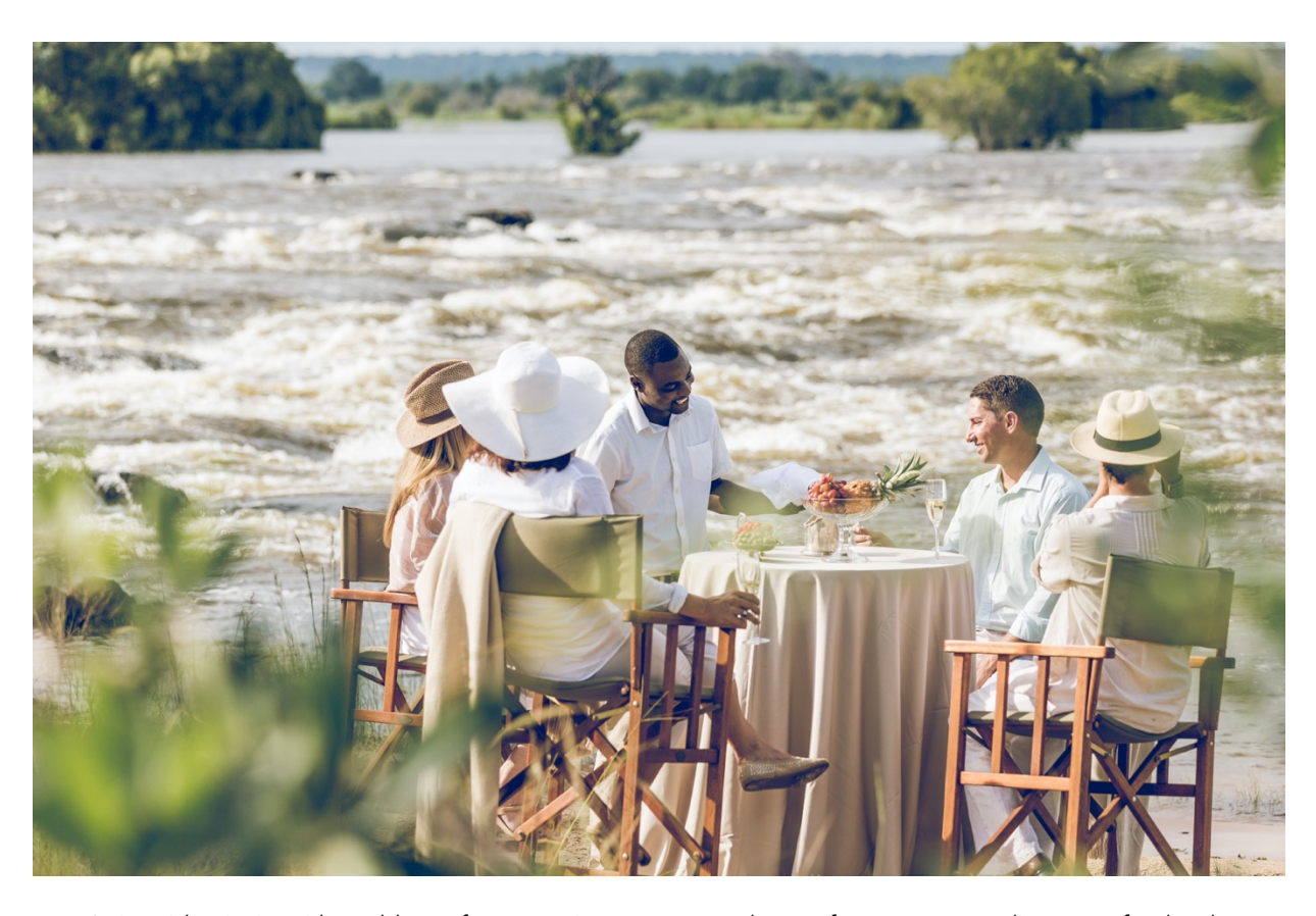
A riverside picnic, with a table set for your private group, and a comfy area set up to linger at after lunch.

If preferred, in the afternoon as the sun seeks West and the light warms to a golden hue after a busy day, you'll be transferred to the Rainforest National Park for your specialist Guided Tour of the Falls. Captivated by the tales of wonder, take advantage of the various viewing points for the best photo angles before being directed to the David Livingstone Statue, where Pure Africa will set up a private cocktail station just for you. Canapés and cocktails, Pure Africa Wine, artisanal spirits and premium drinks will be served just meters away from one of the most popular viewing decks at the falls – it couldn't be more perfect.