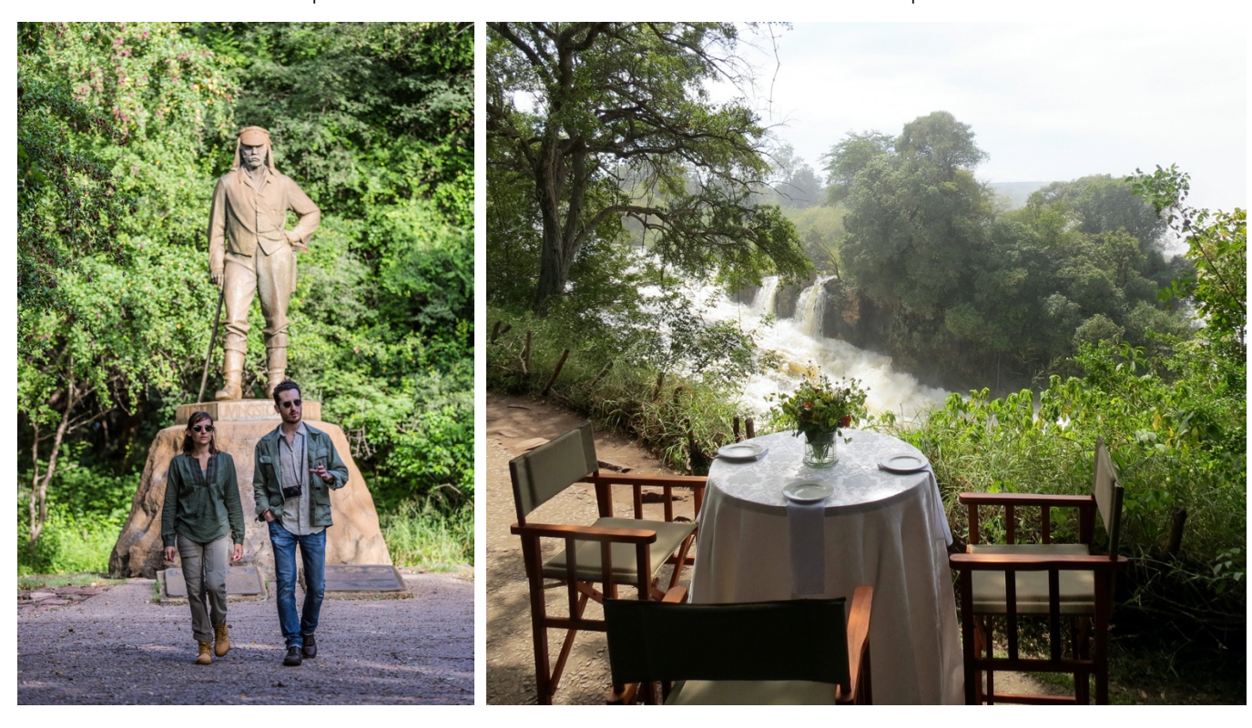
Walking from your guided tour, a table awaits overlooking the crevice of Victoria Falls. www.pure.africa