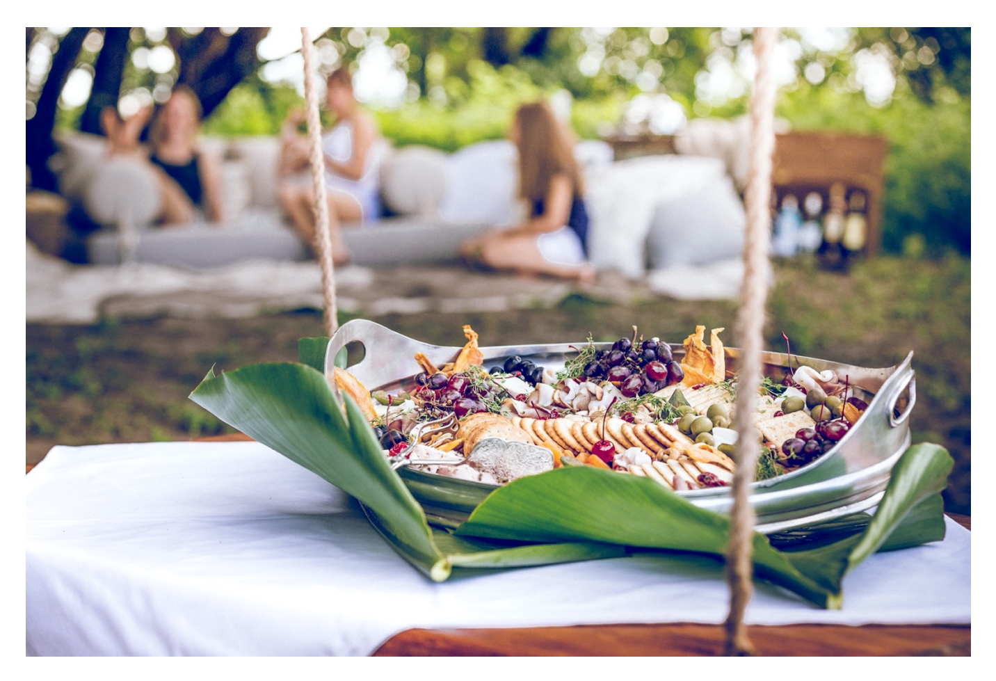
A platter of delicious cheese and snacks set out at the riverside picnic.