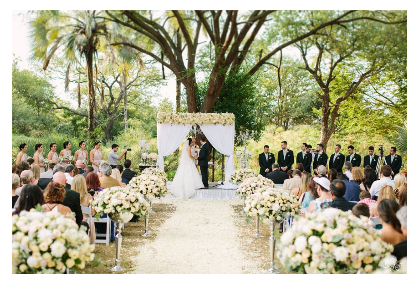
A ceremony hosted under the trees at the Pure Africa Waterfront.