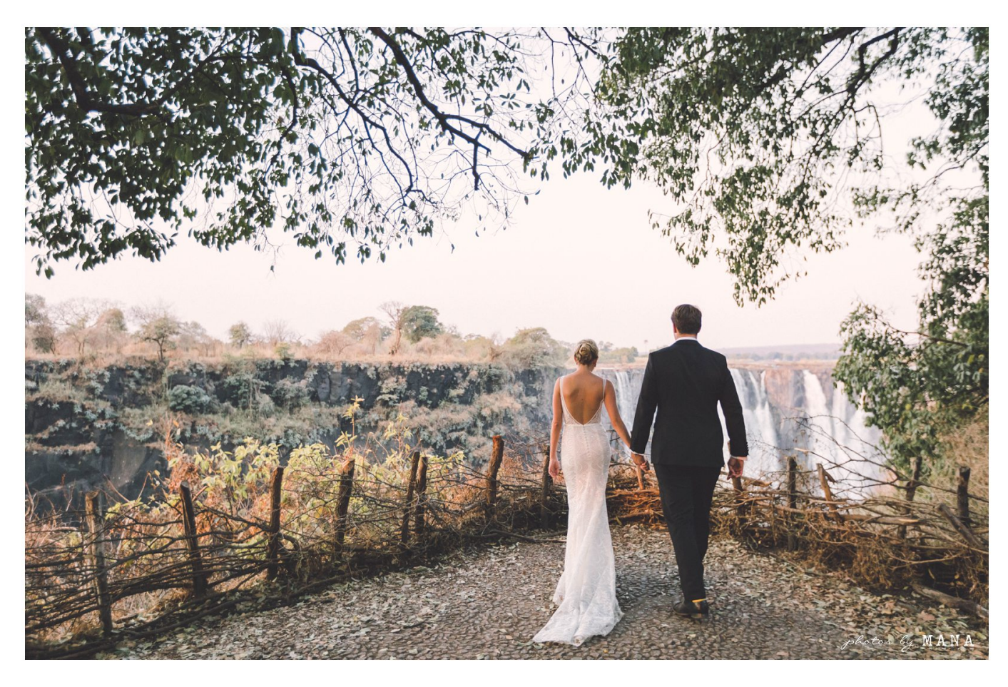
The wonder of love, appropriately matched by the magnitude of one of nature's greatest wonders.