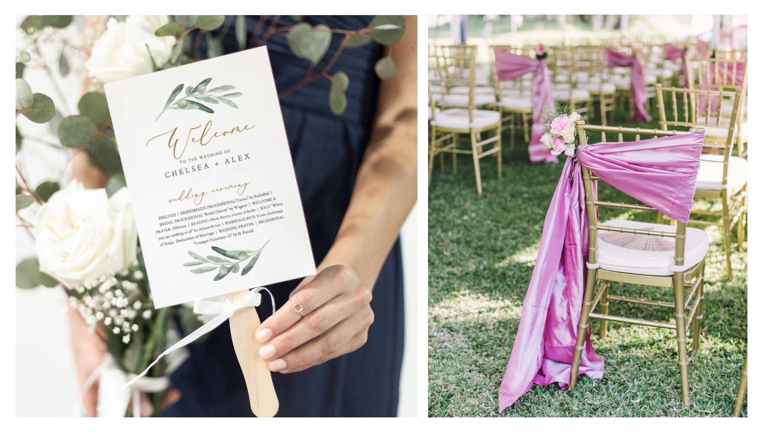
No details too small, or too great. Each meticulously considered.

Table setup onboard the Zambezi Explorer.