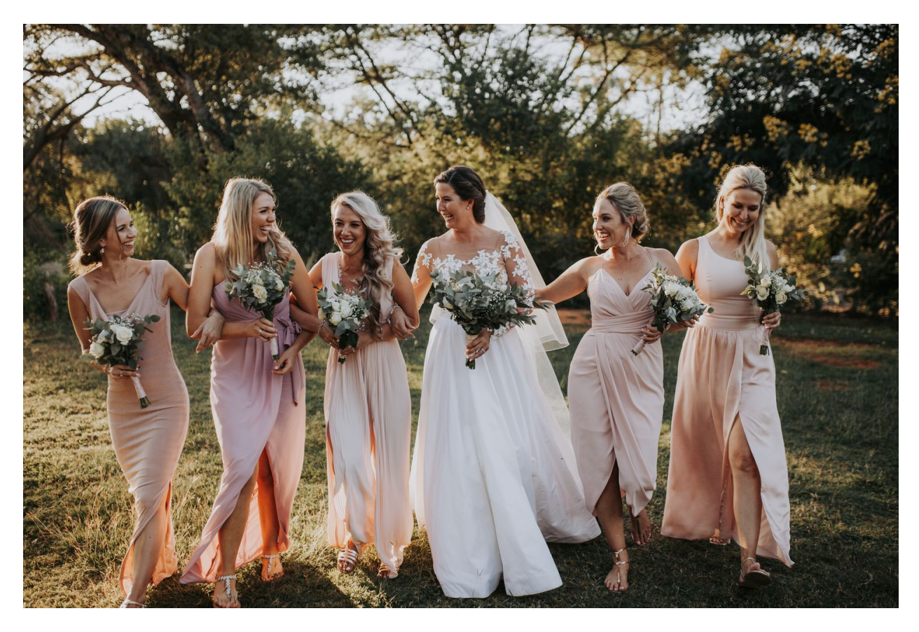
The softening sun illuminates the bride and her beautiful entourage at the Pure Africa Waterfront.