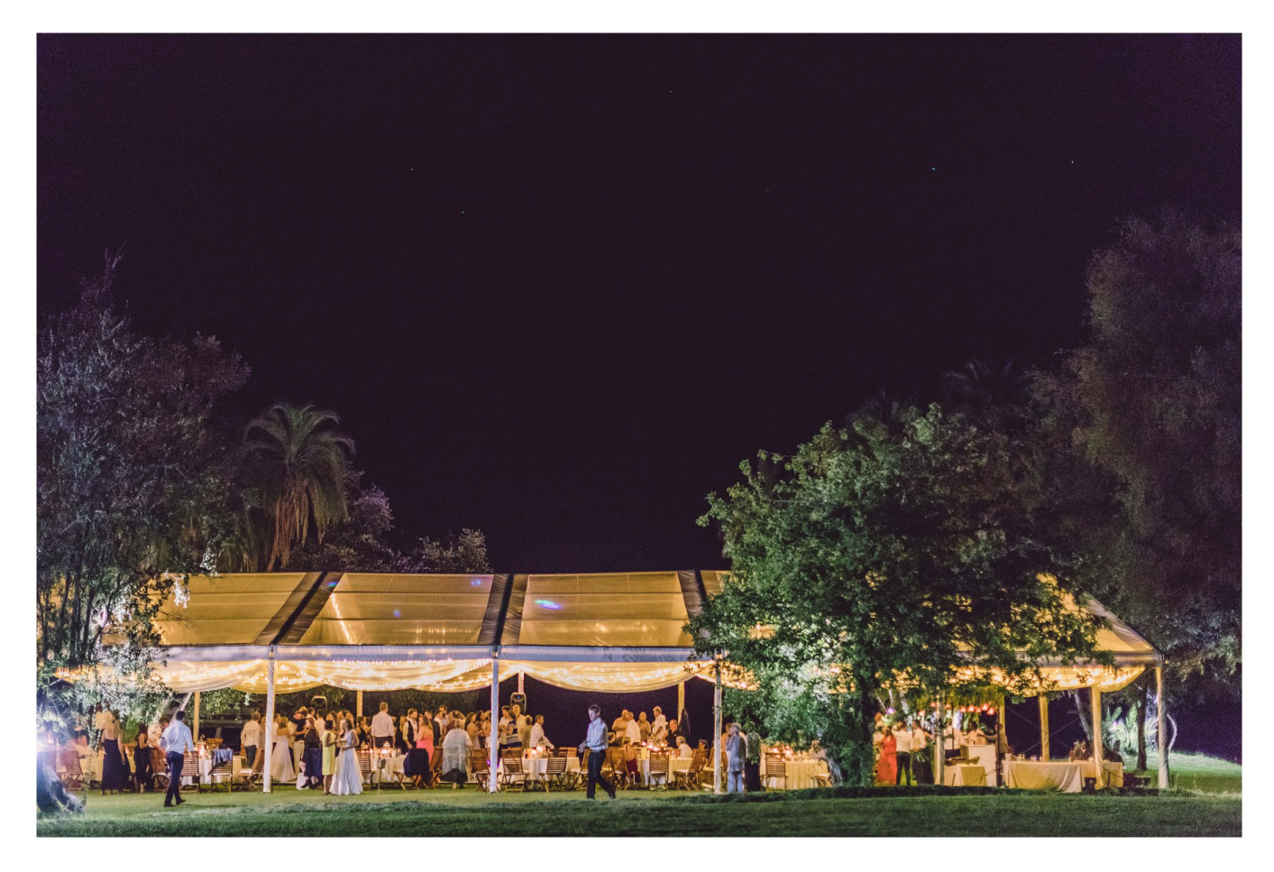
A wedding hosted at Pure Africa Waterfront under the starry African skies.