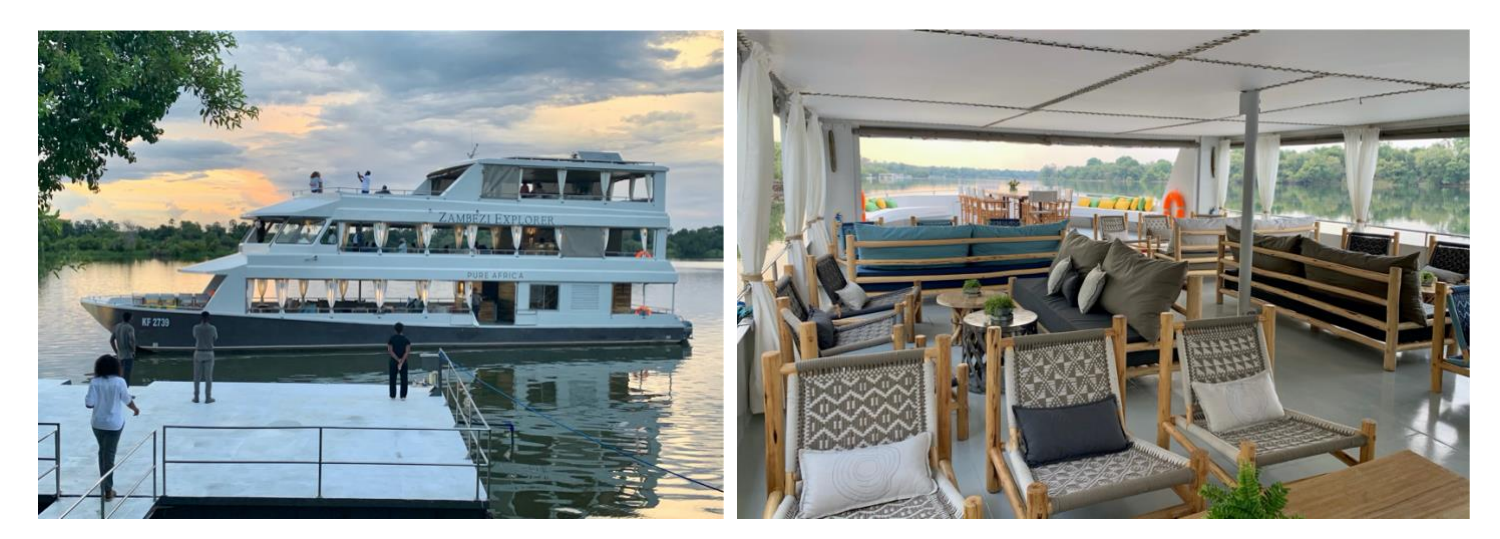
A seamless transition, after your cruise, join The Eatery Dinner Experience at the Pure Africa Waterfront.

Perched on the banks of the river, on return gather around the fire-pit before following the lanterns to your table for dinner – grunting hippos, the call of the fiery- necked nightjar and distant yipping jackals for company. The Eatery Dinner Experience focusses on the quality of the ingredients; freshly baked bread, homemade pasta, Zimbabwe beef prepared to perfection. Alongside potjie dishes cooked patiently over an open fire under a star-studded African sky. What could be better?